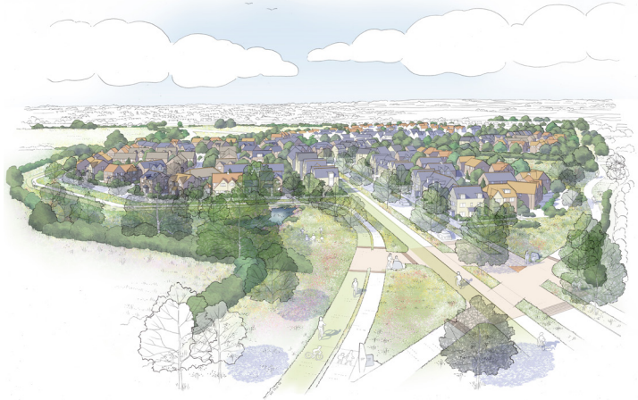
Artist's impression of the revised masterplan for Curborough Brooks

The revised masterplan and supporting Design Code have been designed to ensure they respond to and integrate positively with any future development that comes forward within Curborough Brooks, land at North Lichfield and surrounding areas. We will continue to promote land at North Lichfield for development through Lichfield District Council's ongoing Local Plan process.